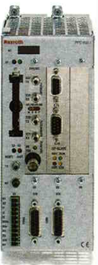
The PPC-R22.1 integrated motion-and-logic controller with SERCOS interface.

installing the new controls, CCS implemented a comprehensive new communications program to modify the original PLC, which remained part of the upgraded system.