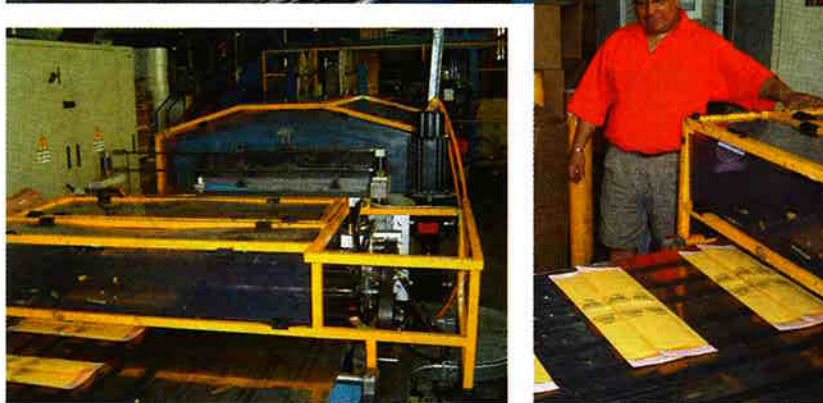
After a comprehensive retrofit of its drives and controls with the latest technologies, this envelope converting system at Polyair's Toronto facility now runs more efficiently than ever before.

After CCS conducted an in-depth study of the existing program logic and machine timing, Stuber and his team were able to identify and correct the problem with a complete retrofit of the drives and the controls package.